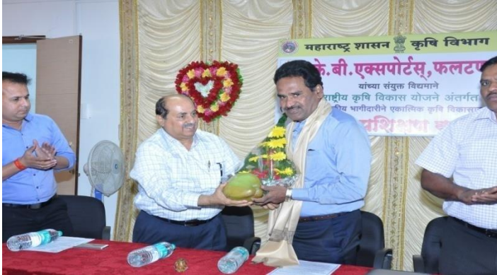
Farmer's Training Program held on 9th December, 2014 at Kay Bee Exports under PPP-IAD 2014-2015